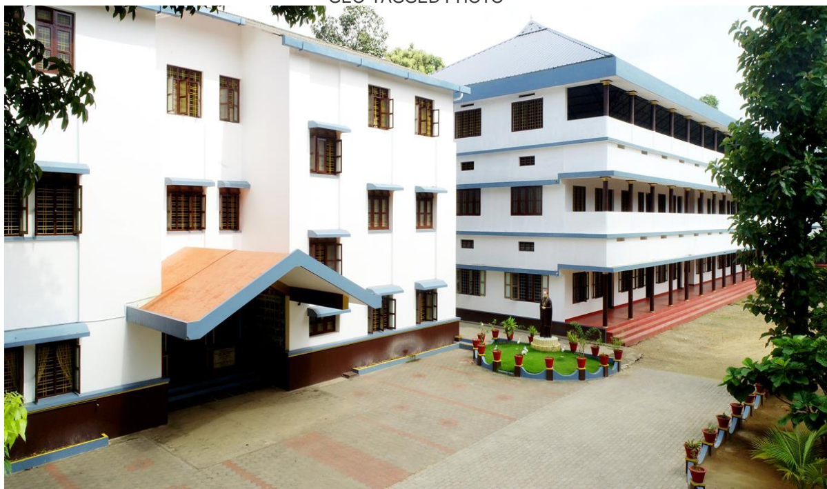
SCHOOL PHOTOS GEO-TAGGED PHOTO